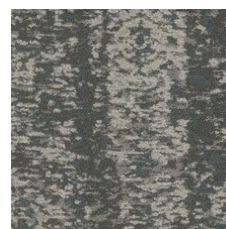
Heritage 85530 LRV 13.4