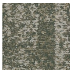
Recollect 85215 LRV 22.6