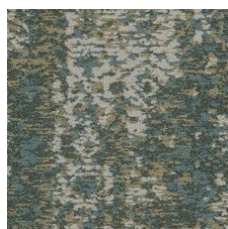
Novelty 85327 LRV 24.5