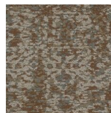
Nostalgic 85665 LRV 14.5