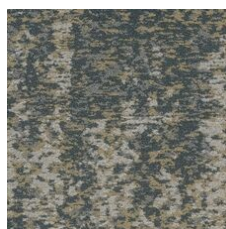
Classic 85496 LRV 17.4