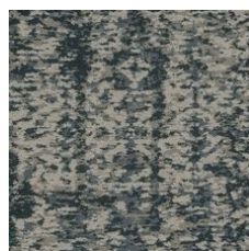
Timeless 85402 LRV 19.6